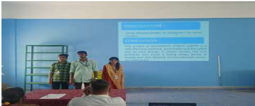
Paper presentation by internal participants

Paper presentation, poster present through Google meet link ( https://meet.google.com/_sar-uehp-tpf ) & two rounds were conducted for technical quiz, code cracking though Google meet link and then the shortlisted students were announced as winners.