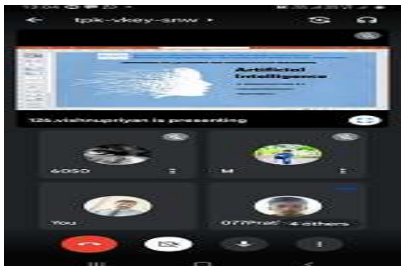
Paper presentation by External participants